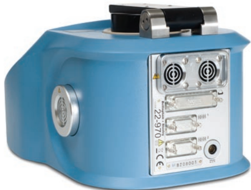
Moisture resistant services panel & instrument housing