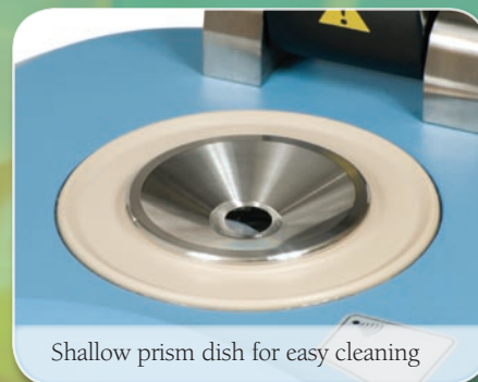
Shallow prism dish for easy cleaning

Refractometers with Peltier Temperature Control for Petrochemical, Pharmaceutical and Other Applications Requiring a Wide Measuring Range.