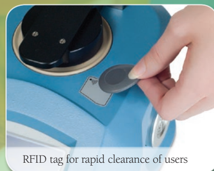
RFID tag for rapid clearance of users